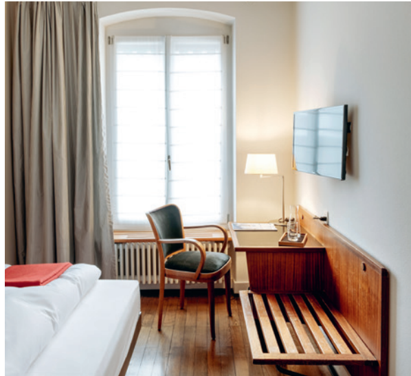
① Krafft Basel, Altstadt Kleinbasel Old and new

Basel's fair-filled calendar means there are certain weeks each year when the top hotels are always fully booked; make arrangements well in advance if you want to be in with a chance. Most hotels offer their guests complimentary travel passes and many have beautiful views of the Rhein. Wherever you choose, you'll always be within walking distance of the city's best restaurants and shops.