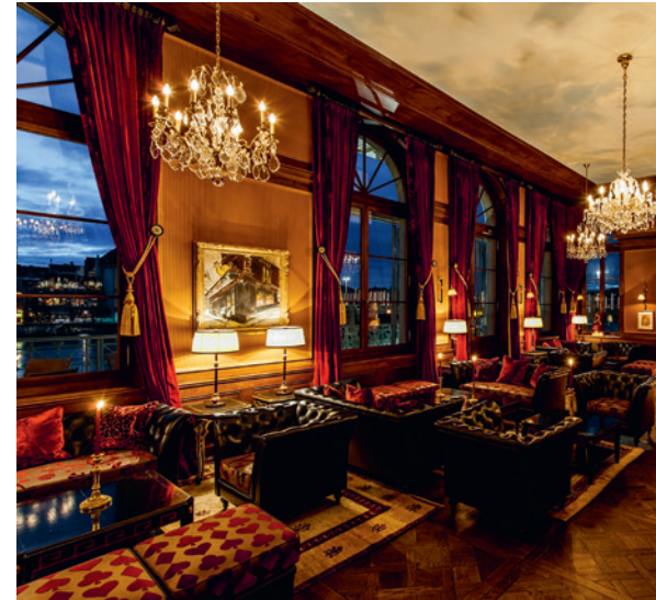
② Les Trois Rois, Altstadt Grossbasel Fit for royalty

Another of the Krafft Group's boltholes, the 65-room Hotel Nomad has a lively restaurant, meeting room, sauna and small but well-equipped gym. It's handily located near the train station and features pops of colour alongside oak doors and concrete walls and floors. nomad.ch